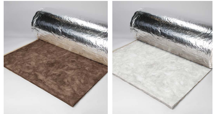
Color of product will differ depending on manufacturing location.

AVERAGE 24% RECYCLED CONTENT POST-CONSUMER